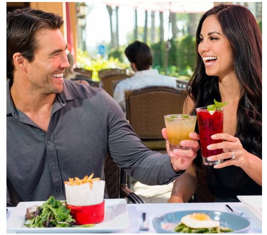
Photoshoot on The Winery's newly expanded patio

The District DOES NOT ENDORSE these booths and encourages calls to be directed to Tustin's Code Enforcement at (714) 573-3134 or email at tustincodeenforcement@tustinca.org .